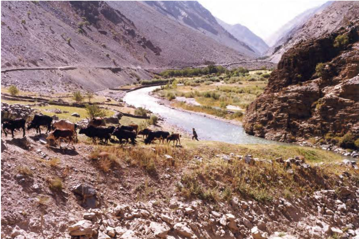
Fig. 3 for Question 2